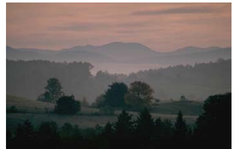
Summer wanes over the hills of the Monadnock Region